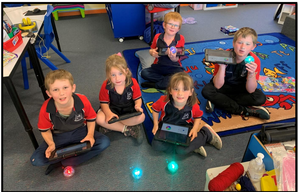
Sphero sprk + learning in our classroom.